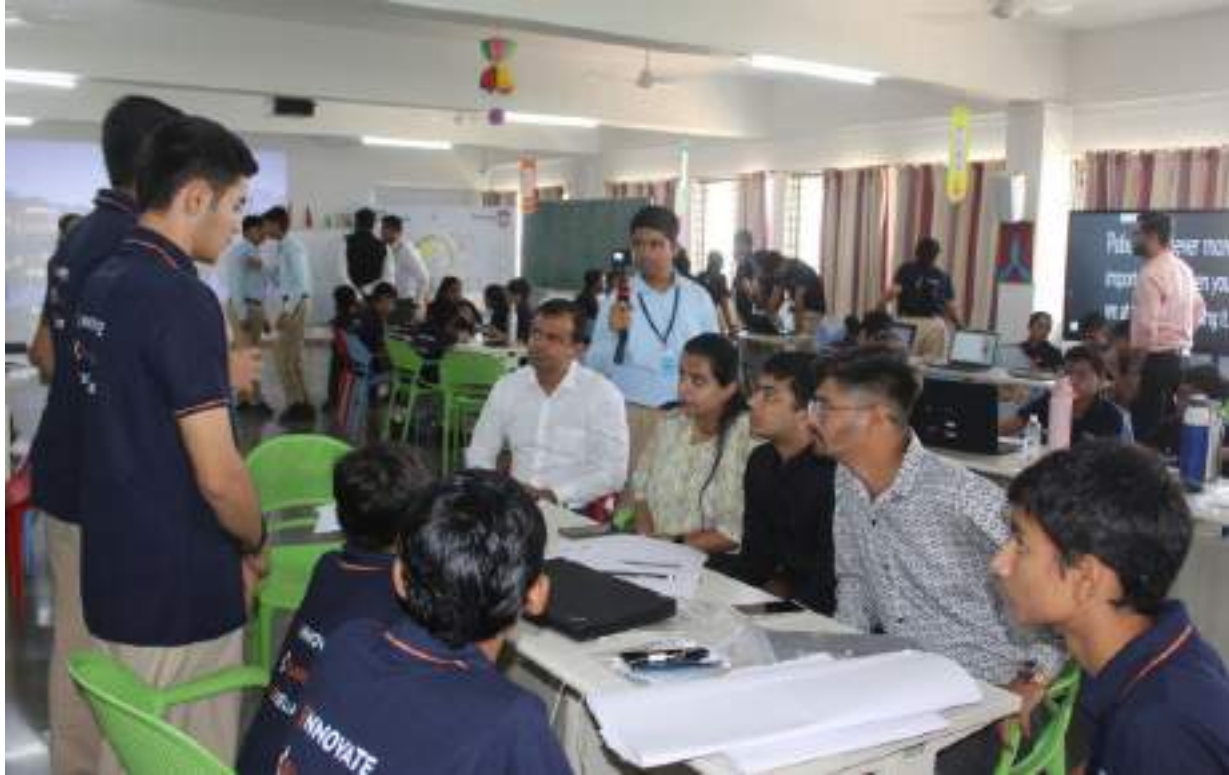
Interaction of students with mentors