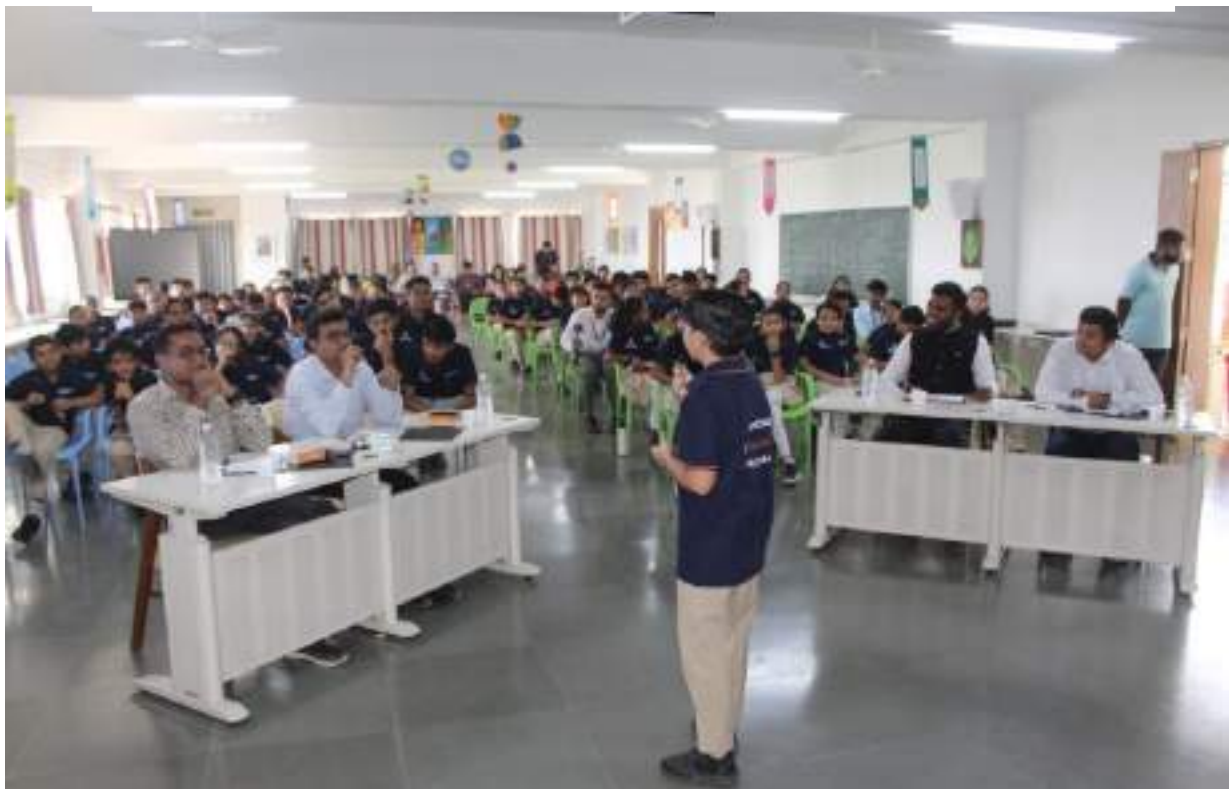
Pitching of the innovative ideas to the Jury