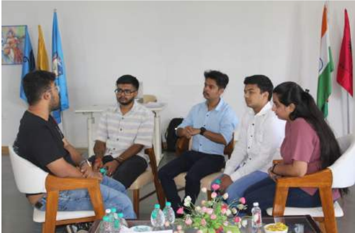
Interaction of the Facilitator with Mentors